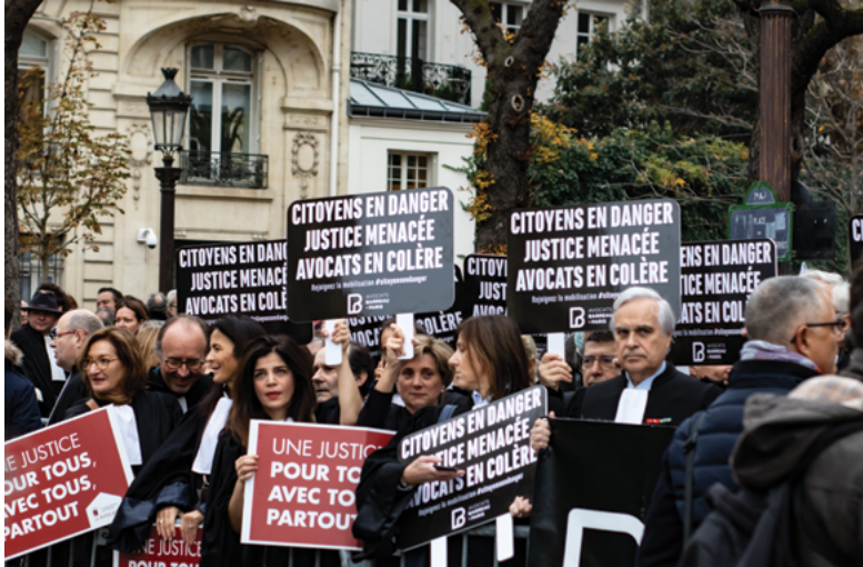
Paris, France—11.15.2018, Protest against the Loi de Programmation.