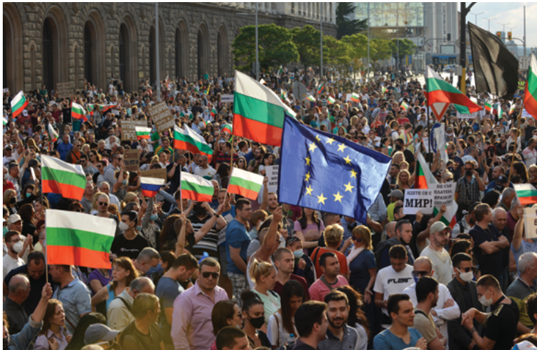
Sofia, Bulgaria—Jul 14 2020, People protesting on the main streets in the capital and demanding PM's resignation.

This misconception was reinforced by Justice Commissioner Reynders during the debates held at the European Parliament on 5 October 2020 , when he stated: “The necessary structures are essentially in place, but Bulgaria has to make them deliver results more efficiently” (EP 2020b). This is a dangerously wrong diagnosis: as stakeholders and scholars have persistently explained, including in direct communication to Commissioner Reynders, the structures themselves are part of the problem. 51 These specialised bodies stand outside the ordinary legal framework, circumventing due process, and are being deployed by the powerful of the day to consolidate their power and deepen the symbiosis between mafia and state. This enables the arbitrary use of power and is hence a direct assault on the rule of law, whose raison d’être is the prevention of tyranny.