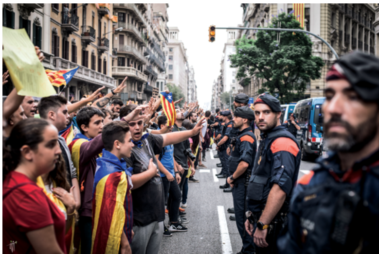
Barcelona, Spain—October 3rd, 2017, Aftermath of the Catalanian independence referendum